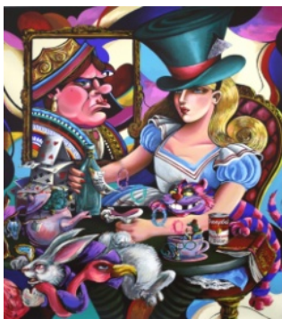
BY JETT JACKSON